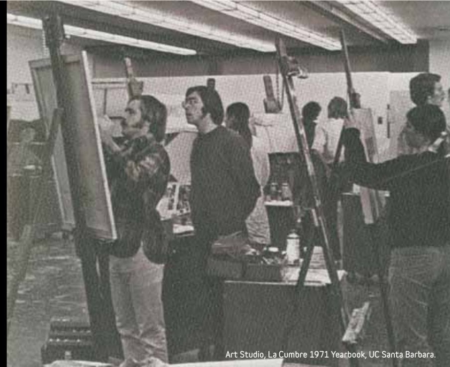
Art Studio, La Cumbre 1971 Yearbook, UC Santa Barbara.