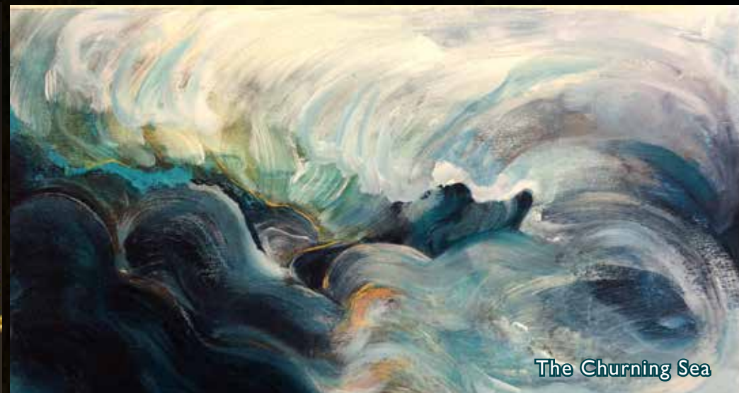
The Churning Sea